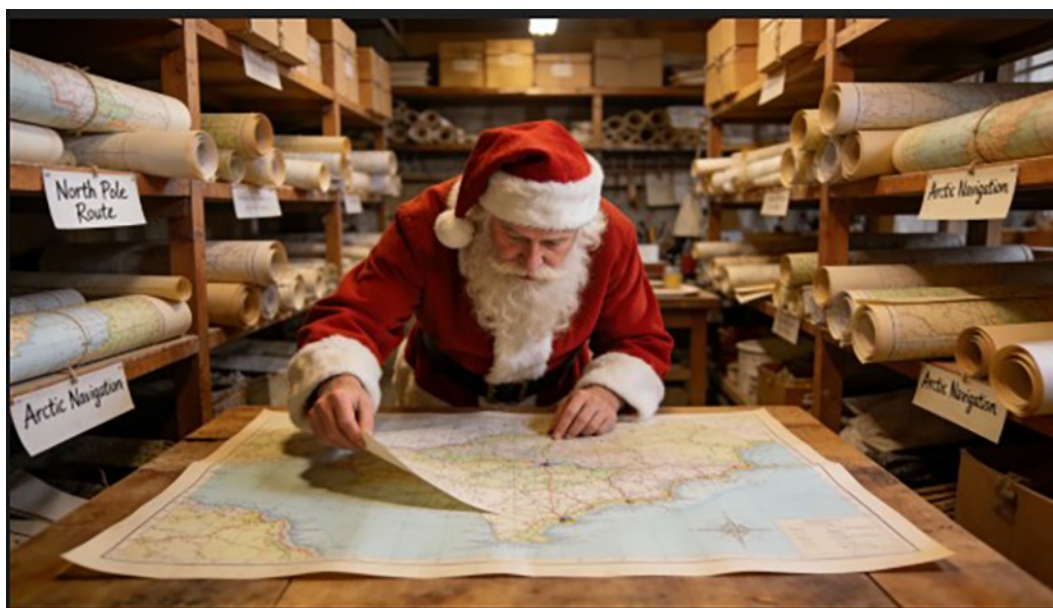
Merry christmas and Happy new year

Sjöfartsverket, Ufs-redaktionen / Swedish NtM, editorial staff. Publ. 17 Dec 2025