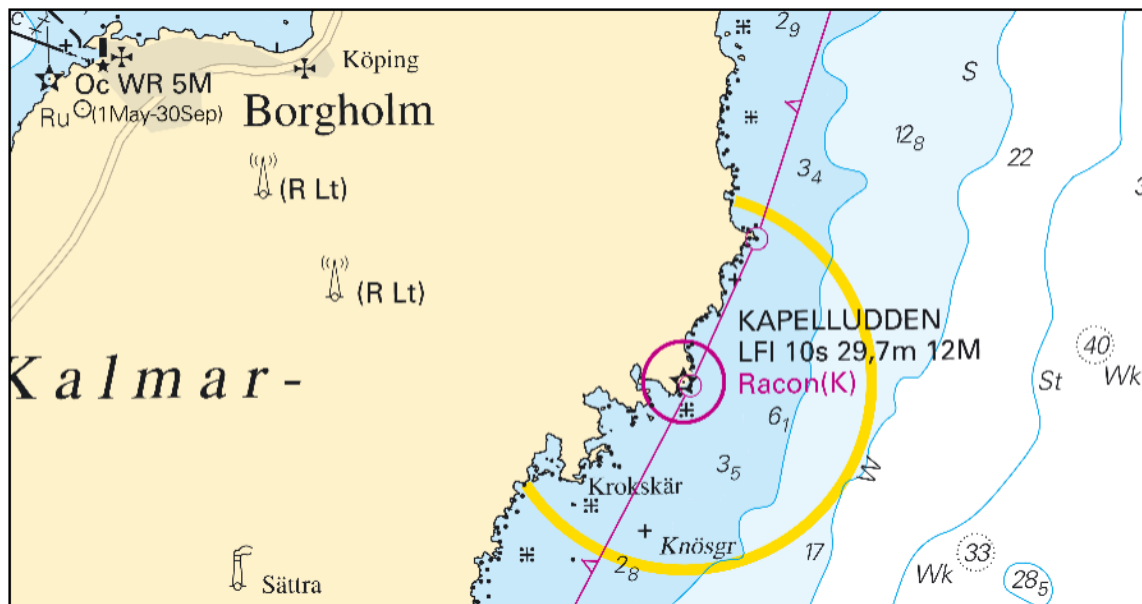
Racon on light 'Kapelludden'